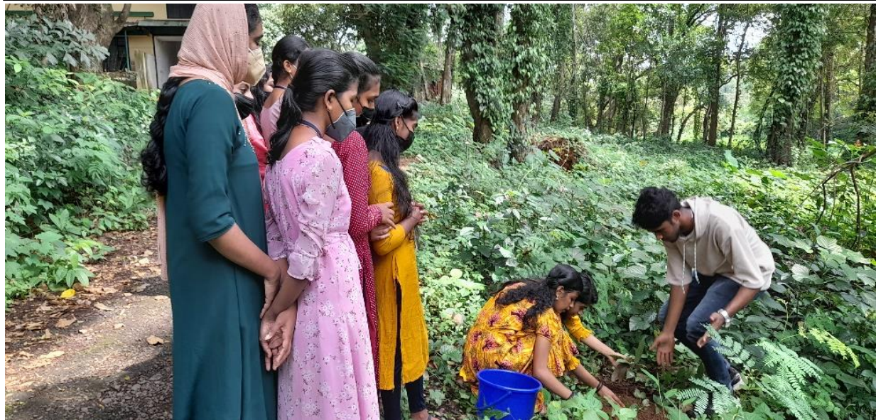
Fruit plants in our BCI location